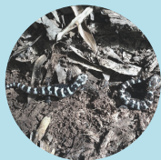
Vernal pools and creeks