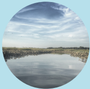
Access to over 300 wetlands acres