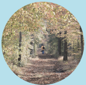
225 forest acres

Our natural and cultural resources include: