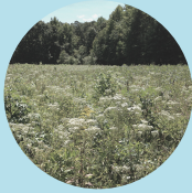
1.5 meadow acres