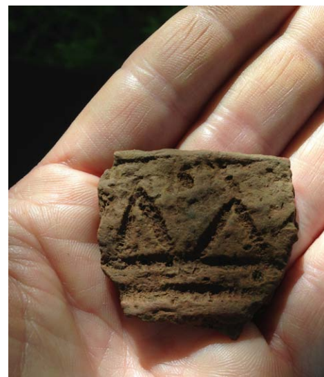
Sherd of highly decorated pottery found near the ritual structure.

Several hearths and storage pits were found near Two Run Branch in the northern end of the floodplain in Area 3. These features likely dated to the Late Archaic and Early Woodland periods, between about 1,500 and 500 B.C., and represent some of the earliest occupation of the floodplain. Participants searched for the earliest occupation of the entire River Farm site in the uplands of Area 4, and a magnetometer survey conducted at the beginning of the Field Session revealed several compelling