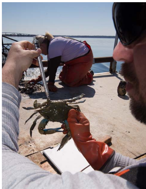
Maryland DNR staff conducting a winter crab survey.

June's dissolved oxygen levels were the 2nd best since 1985. MDDNR measured the Bay's hypoxic (low oxygen) zone at 0.42 cubic miles, compared with 1.11 cubic miles